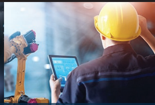
INTELLIGENT CONNECTIVITY & COMPUTING