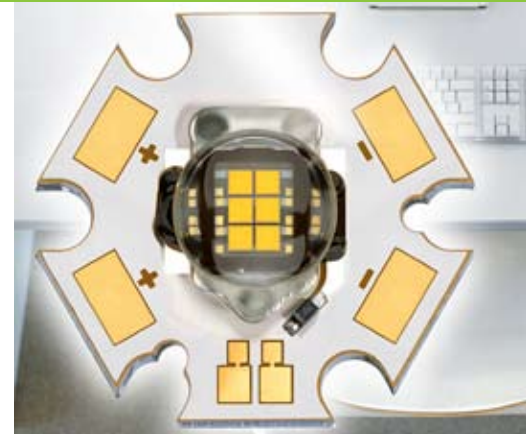
OSRAM Opto Semiconductors Photo credit: OSTAR™ Lighting